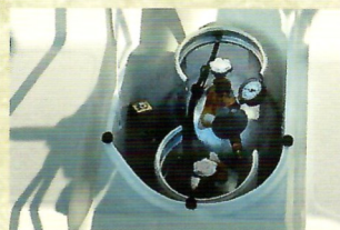
The propane locker is convenient in the cockpit.