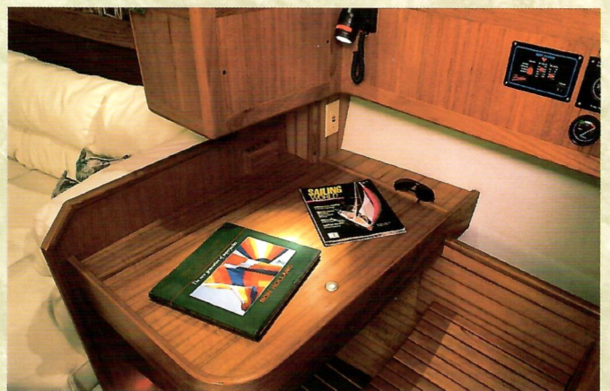
A full-size nav station can house all the gear in the overhead panels.