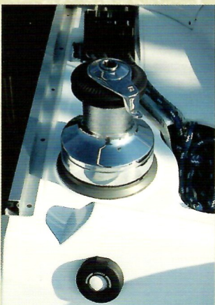
A standard Lewmar® electric halyard winch takes the stress out of raising the main or the bosun's chair.