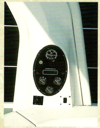
Engine instruments are positioned on the arch, leaving more space on the console for electronics.