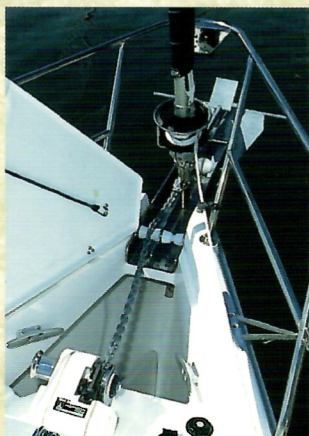
Offset anchor rollers, a deep chainfall and under deck windlass make handling ground tackle a snap.