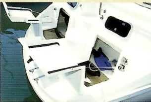
Full-transom storage is easily accessible and can house a dinghy, outboard, and even a set of scuba tanks.