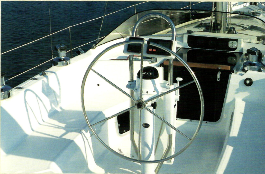
A wide-open cockpit houses the rack and pinion steering, cockpit table, a full array of electronics plus allows additional seating and storage.